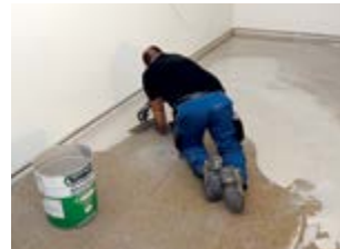
Application of main coat