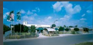
Silikal production and administration in Mainhausen, near Frankfurt/Main, Germany.

Contact us. We will be pleased to support you – free of charge and without any obligation for you.