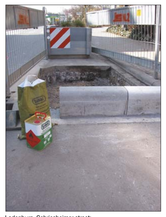
Ladenburg, Schriesheimer street: Building a flower bed with kerb bricks stuck to the asphalt with SILIKAL® Mortar R 17