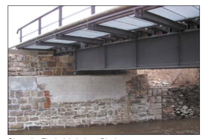
Chemnitz-Einsiedel viaduct, Blankenauer street: repairing bridge bearings