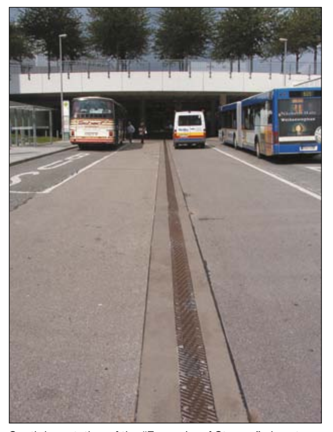
South bus station of the "Franz-Josef Strauss" airport, Munich: