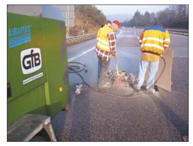
A3 Motorway, Neustadt/Wied: Improving the road surface