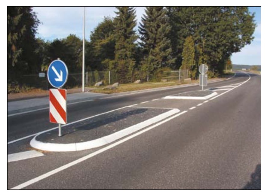
K 106 by-road, Neuwied-Niederbieber: Kerb of a traffic island stuck to the asphalt with SILIKAL® Mortar R 17