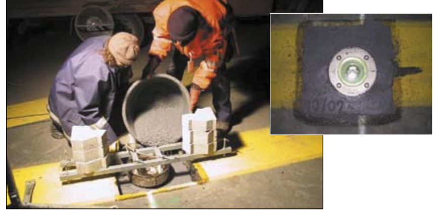
Nordrhein-Westfalen Airport: Replacing and installing embedded runway lights without air-traffic interruption