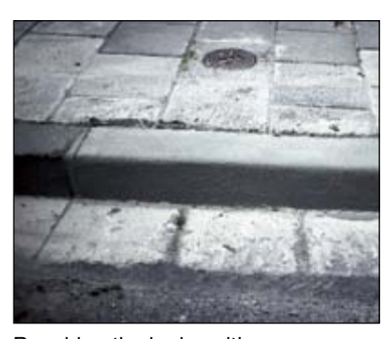
Repairing the kerbs with SILIKAL® Mortar R 17