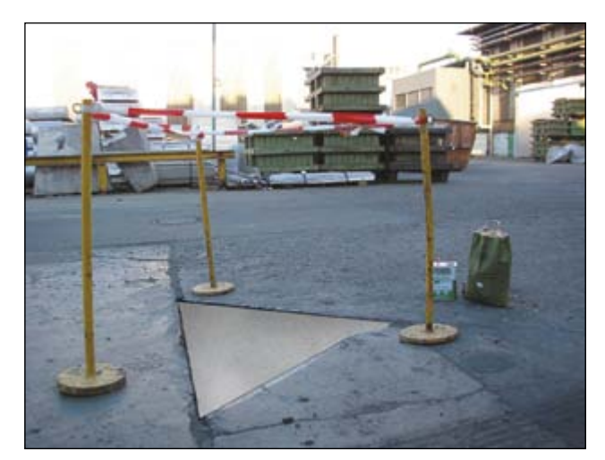
CORUS aluminium rolling mill, Koblenz: Repairing traffic areas