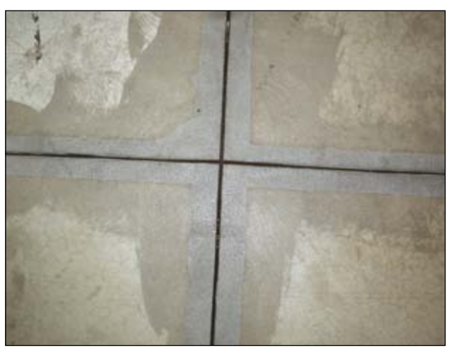
May Werke GmbH & Co. KG, Erftstadt-Köttingen: Renovation of expansion joints