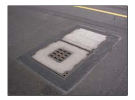
Nordrhein-Westfalen Airport: Sealing cable ducts with asphalt-coloured SILIKAL® Mortar R 17

Silikal product information Version R 17 – 2.00.A March 2012