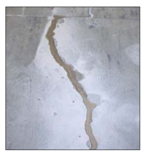
Crack grouting / renovation of floor areas