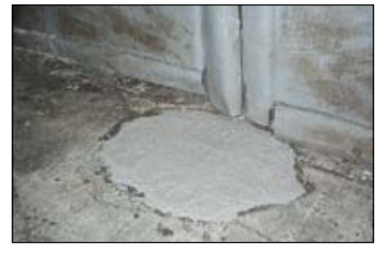
Figure on top: Deutsche See GmbH & Co. KG, Bremerhaven:

Repair of floor areas in cold store house with SILIKAL® R 17 mortar with no disruption to operation (-25 °C)