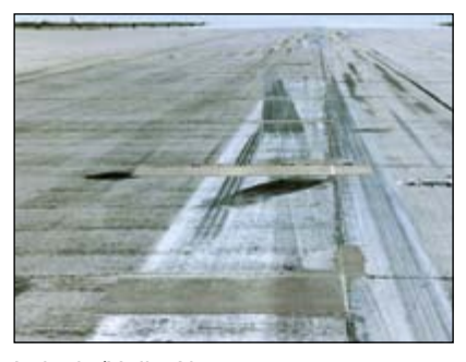
Leipzig/Halle Airport: Repairing concrete, runways and taxiways