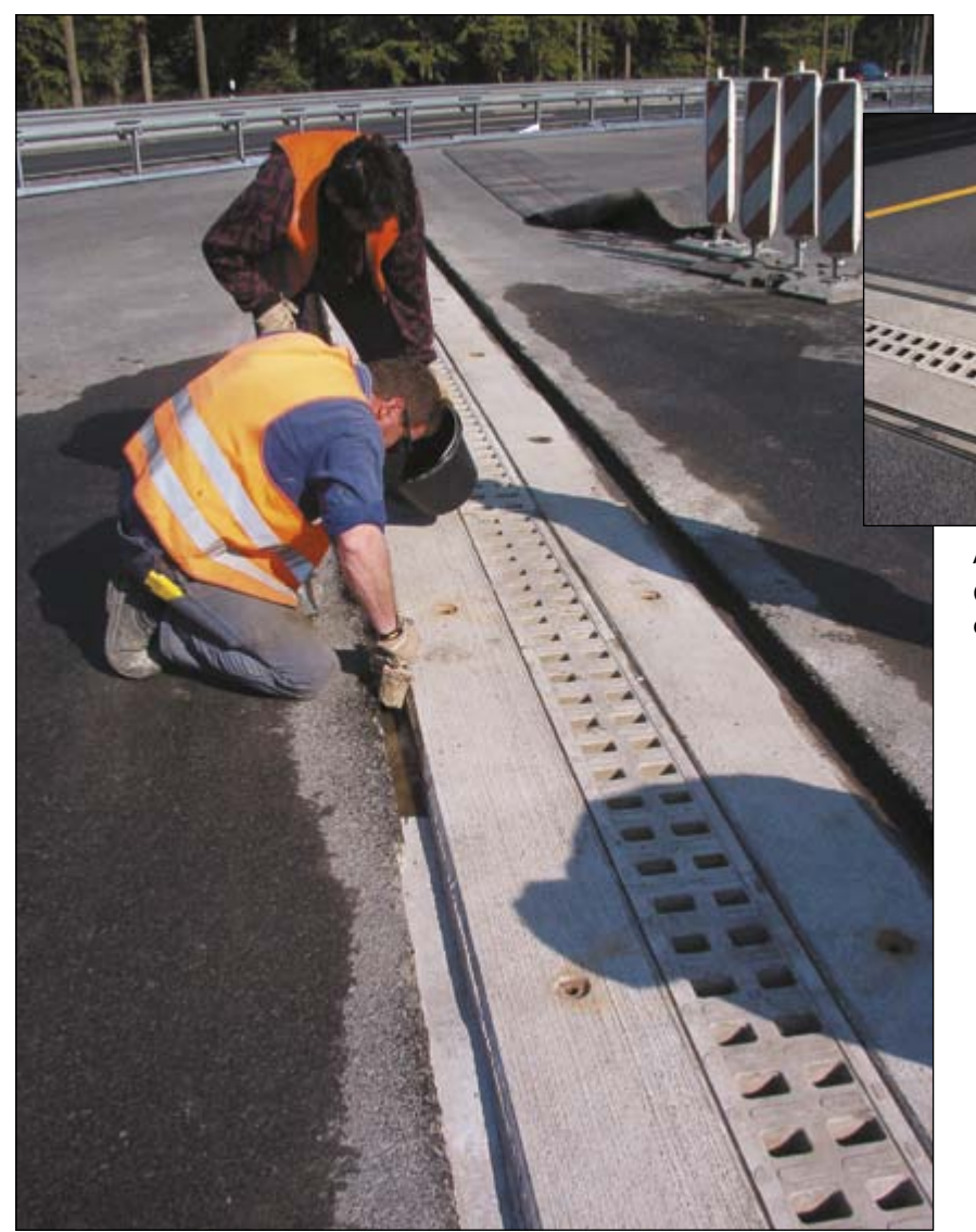
A2 Motorway, Hamm-Uentrop: Construction of transverse drainage channels