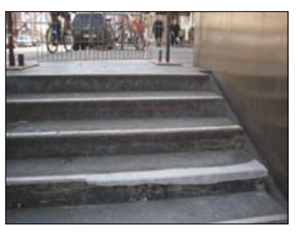
Metro station stairs in Venloer street, Cologne: repairing the steps