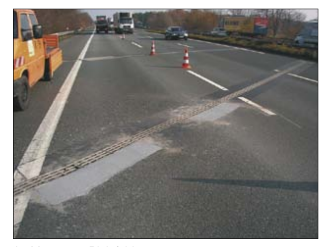
A2 Motorway, Bielefeld: Repair of transverse drainage channels