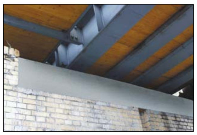
Metropolitan viaduct, Berlin, Sterndamm: repairing bridge bearings