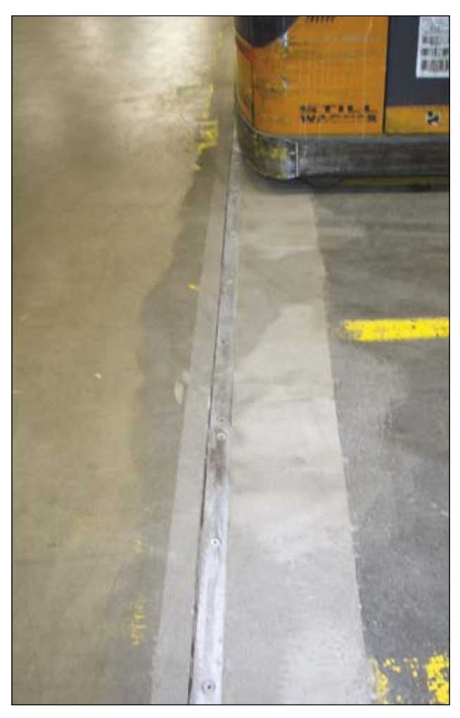
Metro AG, Essen: Renovation of expansion joints in a warehouse