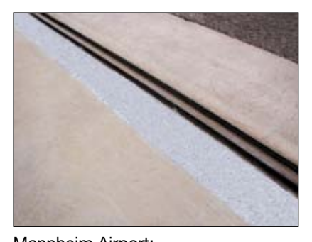
Mannheim Airport: Laying foundations of sliding door rails